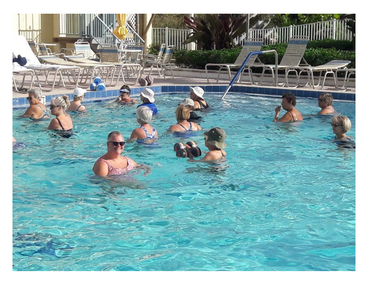
Image 2: Aquafitness in an outdoor pool in Florida.

had been the place of worship of the mass shooter who killed 49 mostly queer Latinx people dancing in their sanctuary at the Pulse nightclub in Orlando.