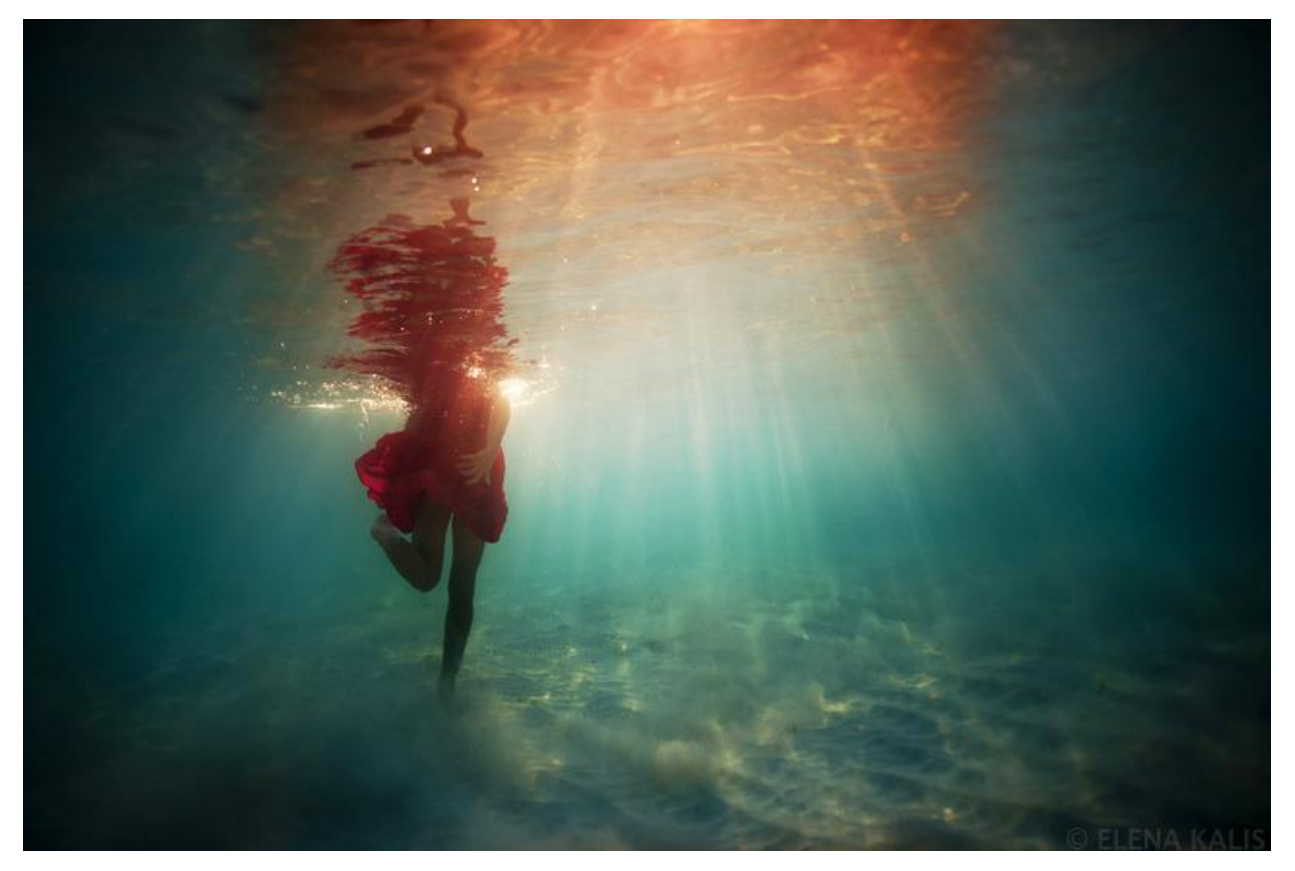
Figure 7. "Underwater_elena_kalis55" by Elena Kali (n.d.). Reprinted with permission. A woman is walking along the sandy ocean floor. She is wearing a short red dress that swirls around her legs. Only the woman's body can be seen, as her head pokes above the surface. In streaks, light shines downward through the water's surface in a kaleidoscope of colour.

Docherty-Skippen, "Navigating the Terrain of Dis/Ability" CJDS 8.4 (June 2019)