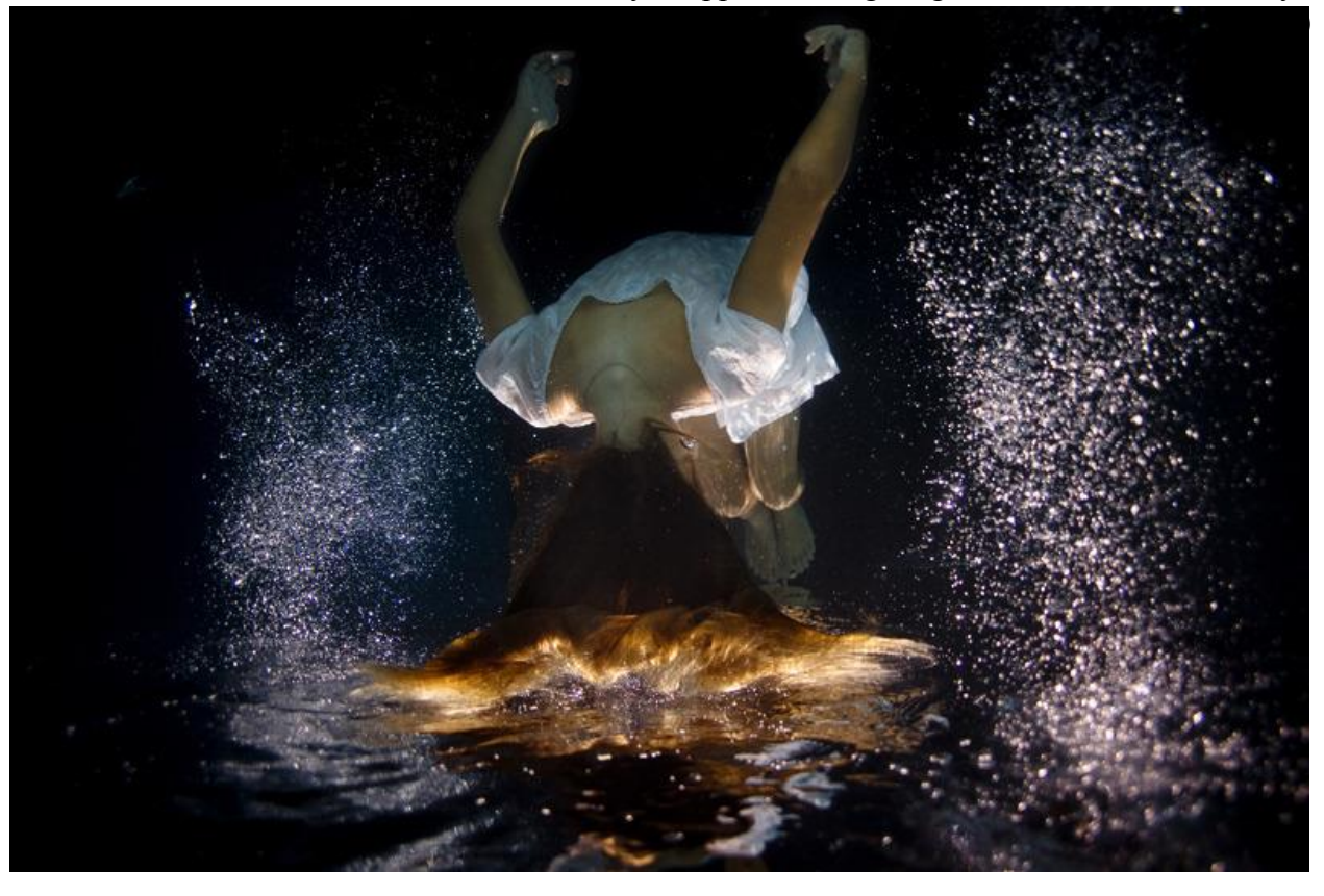
Figure 3. "Underwater_dark01" by Elena Kalis (n.d.). Reprinted with permission. A woman wearing a white cotton dress is submerged under water. Her body is flipped upside down. In contrast to the darkness of the water, tiny white air bubbles surround the woman's body. Her face cannot be seen, only the back of her head and long amber hair.

Docherty-Skippen, "Navigating the Terrain of Dis/Ability"