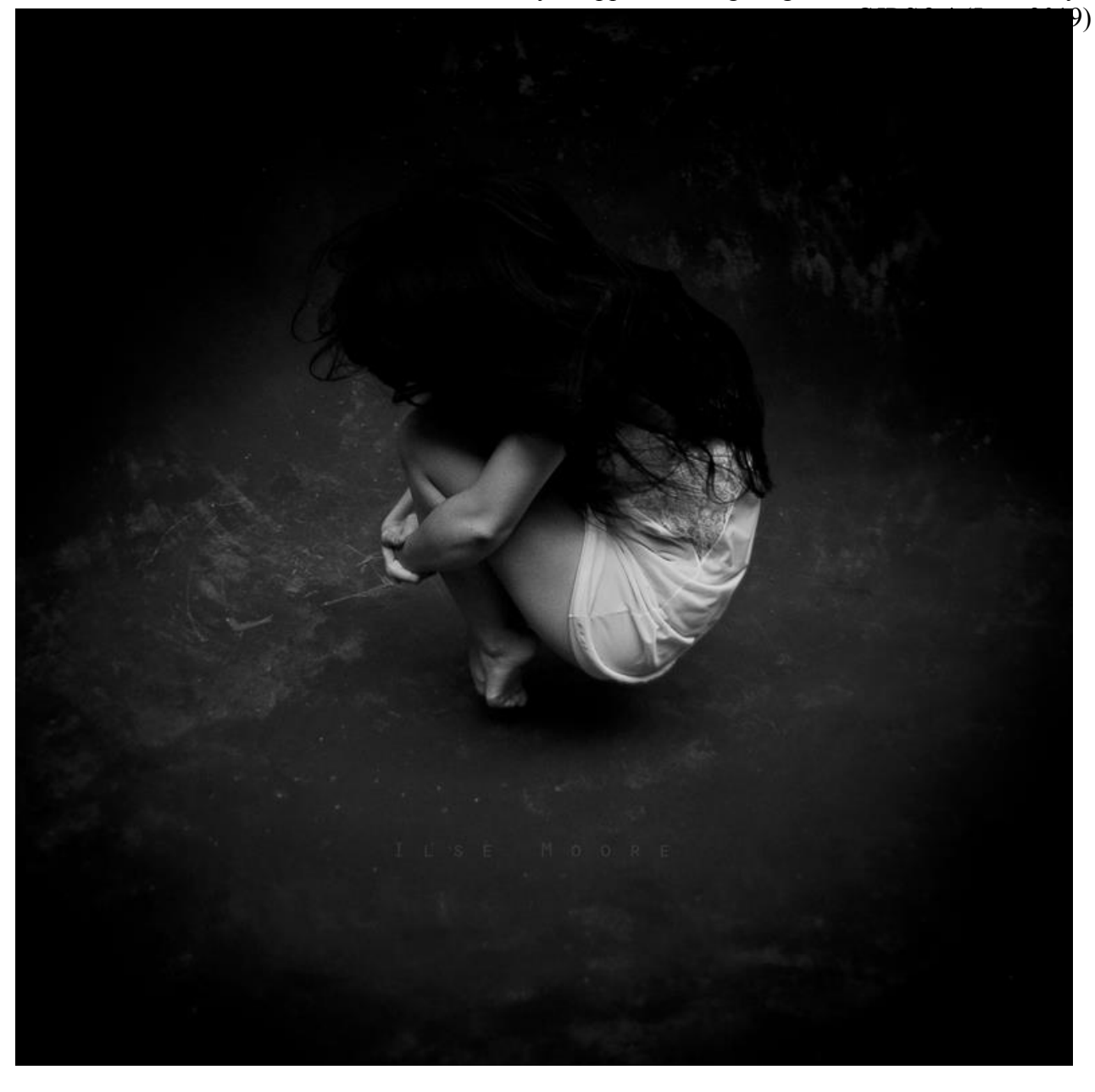
Figure 5. "Lightness and Darkness" by Ilse Moore (n.d.). Reprinted with permission. A woman wearing a short white dress is submerged underwater. Holding her shins with her hands, the woman's knees are tightly tucked into her chest. The watery backdrop is black. Only the silhouette of the woman's dress, legs and arms are visible.

Docherty-Skippen, "Navigating the Terrain of Dis/Ability"