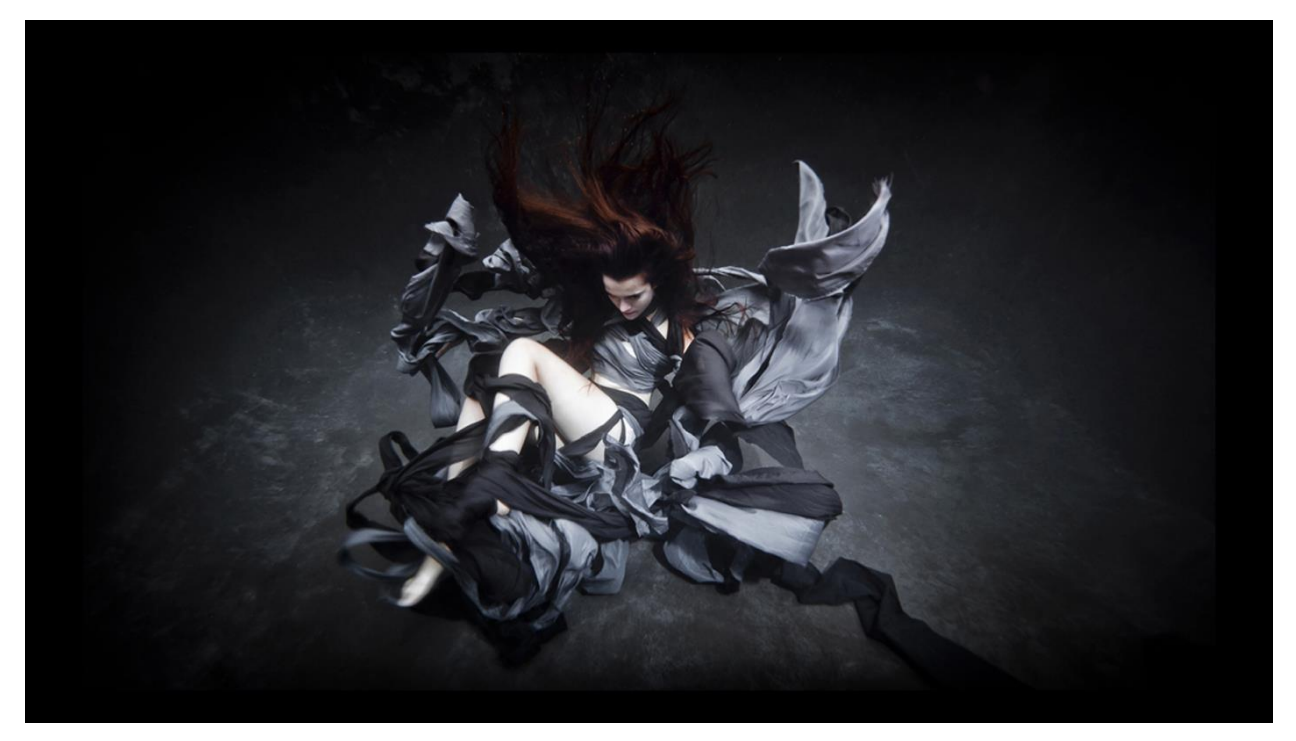
Figure 6. "Dancers and Warriors" by Ilse Moore (n.d.). Reprinted with permission. A woman, with auburn hair that swirls around her head, sits at the bottom of a blackened pool of water. Her legs are bent at the knee and her toes point forward. Light and dark grey sashes are loosely wrapped around her legs, arms, and torso. Perched on her back are a set of silver opalescent wings.

Docherty-Skippen, "Navigating the Terrain of Dis/Ability" CJDS 8.4 (June 2019)