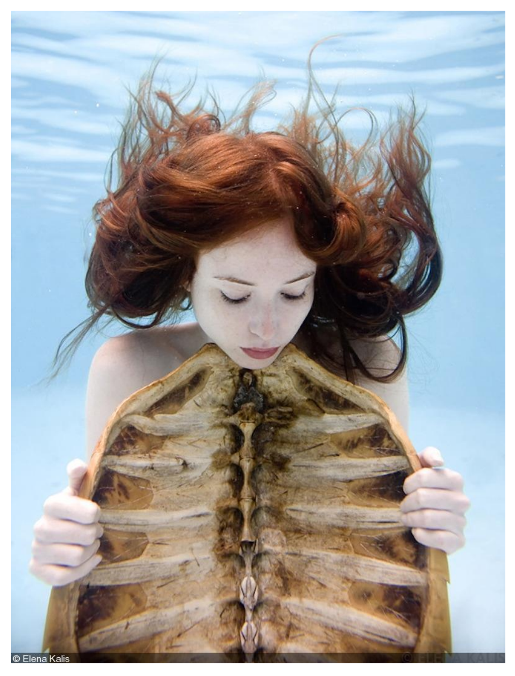
Figure 4. "Underwater_elena_kalis21" by Elena Kalis (n.d.). Reprinted with permission. Against a light blue underwater backdrop, a girl holds a tortoise shell in front of her chest. The underside of the tortoise shell is exposed showing the ossification of its spine and ribs. The girl's auburn-red hair swirls around her head.

Docherty-Skippen, "Navigating the Terrain of Dis/Ability" CJDS 8.4 (June 2019)