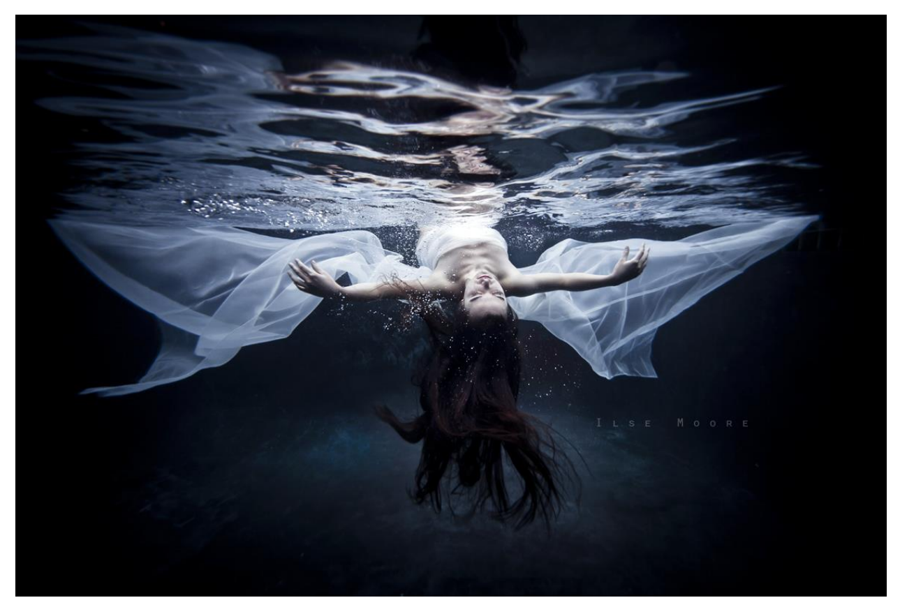
Figure 1. "The Immortal" by Ilse Moore (n.d.). Reprinted with permission. A female body lies just beneath the surface of a blackened water background. Her eyes are shut. Her face is turned up towards the surface and her arms are outstretched along her side. The woman is wrapped in a white chiffon scarf which floats around her arms like angel wings.

Docherty-Skippen, "Navigating the Terrain of Dis/Ability" CJDS 8.4 (June 2019)