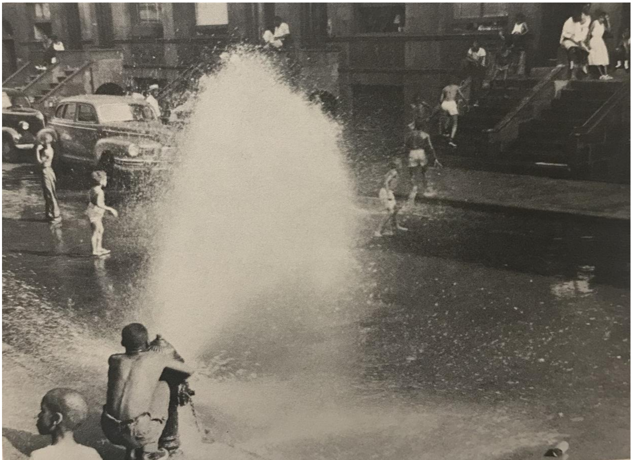
Figure 1. Children playing on a street, with a fire hydrant (DeCarava & Hughes, 1967, p. 23).

express Black people as “a subject worth of art” (DeCarava, 1996, p. 51). Whether it was children playing in the street (Figure 1) or lovers in an intimate moment of embrace (Figure 2), all of which DeCarava photographed, as Hilton Als (2019) expresses, “is alive the experience of being” (para. 4).