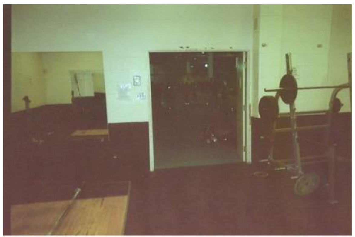
Image 3. An athlete's photograph of an exercise room where she lifts weights with her teammates (Weiss et al., 2017)