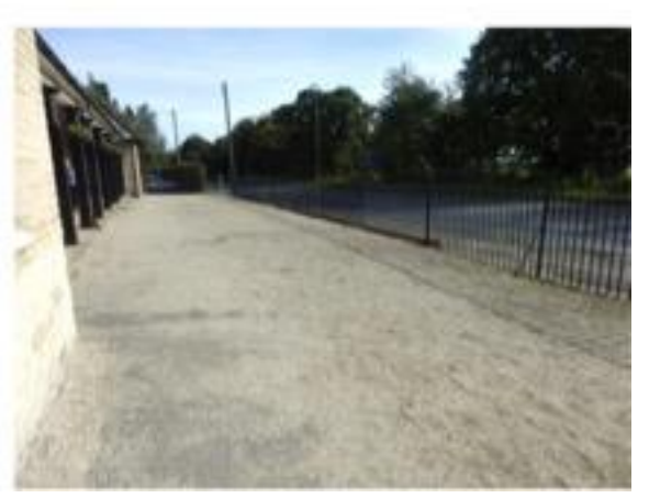
Image 2. Photographs where autistic students felt listened to at school (from the study by Zilli et